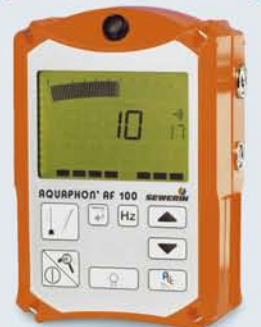
AQUAPHON® AF 100 Combination receiver for electro-acoustic water leak detection and pipe location

Leak detection within structures can involve working in some tight locations. To carry out this work we provide the small, light, microphone EM 30 complete with short probe tip. Also available: Magnet, tripod and compact case.