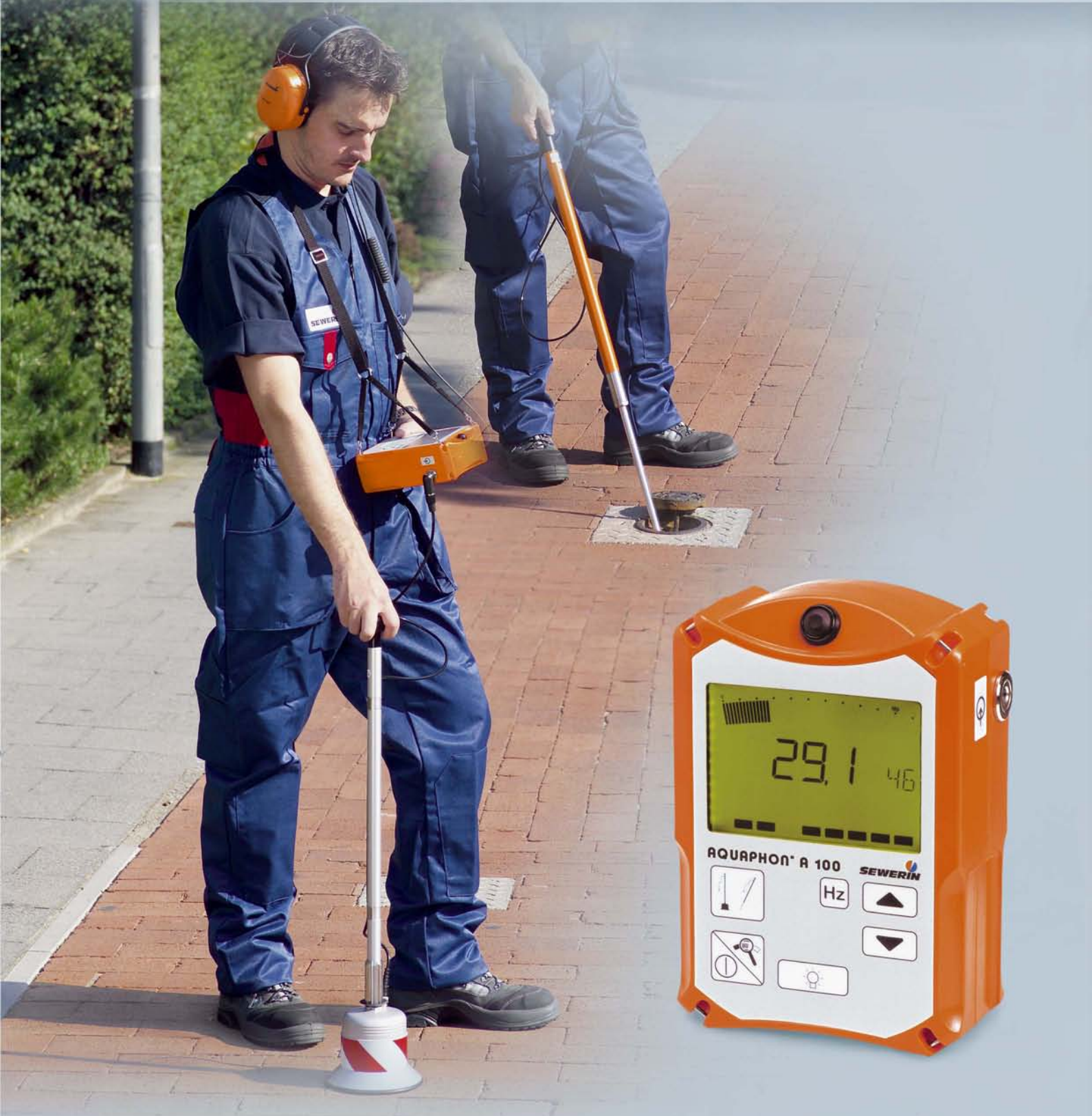
Receiver AQUAPHON® A 100 Electro-acoustic water leak detection