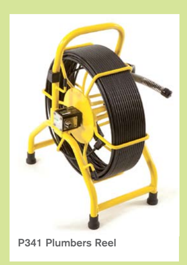
Standard equipment may vary due to regional variations.

Plumbers reel system includes a built-in 512/640Hz flexisonde.